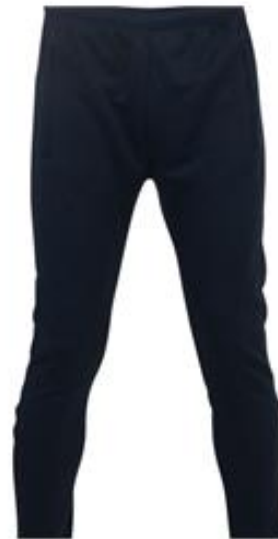
Plain Navy Tracksuit Bottoms