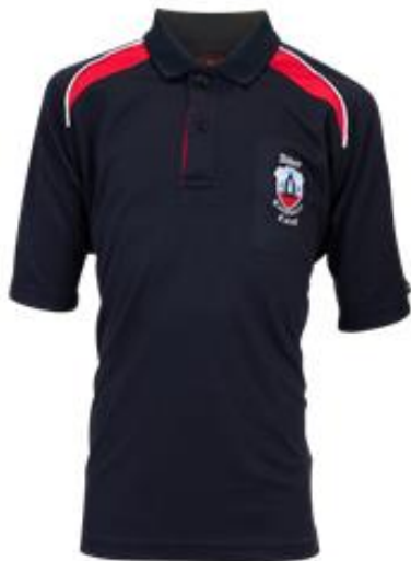
Crested Navy Polo Shirt