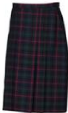
Knee-Length Argyle Tartan Skirt