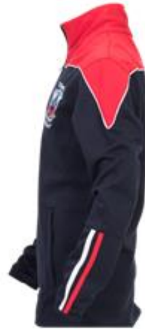
Official School Crested 1/4 Zip