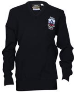
Navy V-Neck Crested Jumper