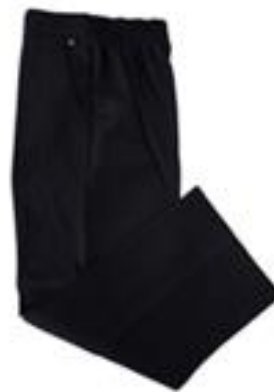
Plain Navy Formal Trousers with Pockets