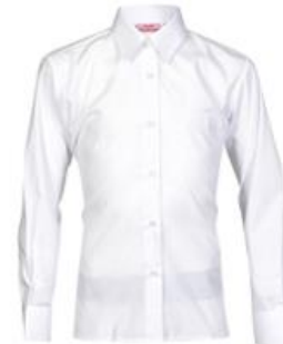
Plain White Collared Shirt