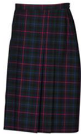
Argyle Tartan Skirt Knee-Length