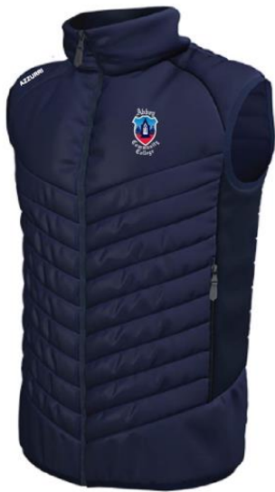
Navy Crested Gilet

All additional items can be purchased from Azzuri, Waterford ( www.azzuri.ie/Abbey-Community-College )