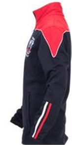
Crested 1/4 Zip