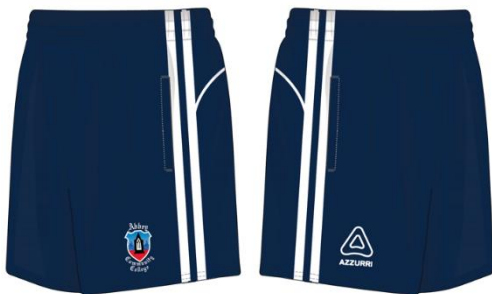
Navy Crested Sports Shorts Can be worn for PE class only. (Cannot be worn during class time)