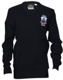
Navy Jumper with Crest