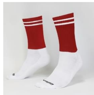
School Colours Sports Socks Can be worn for PE class only.