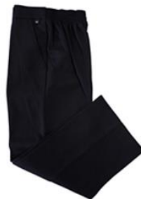
Plain Navy Trousers