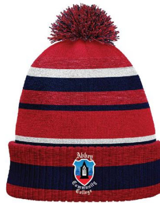
School Crested Bobble Hat (Cannot be worn during class time)

Can be worn in class in addition to main uniform. (Cannot replace school jumper)