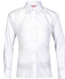
Plain White Shirt