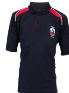
Crested Navy Polo