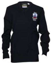
Navy Jumper with Crest