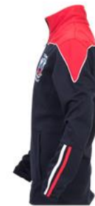
Crested 1/4 Zip